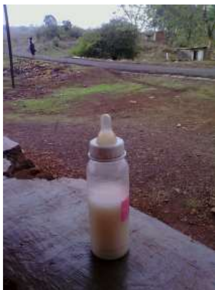
Fig-1: Feeding bottle

The child was registered in the ‘Anganwadi’ since birth. The anganwadi worker tried to communicate with the child’s parents that, it would need special care and regular growth monitoring. They were asked to take the child to a tertiary care hospital but, the parents were non-compliant and despite efforts by health workers they remained non-cooperative.