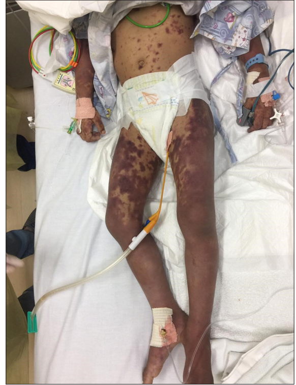
Figure 1: Petechial rash on leg.

Neisseria meningitidis is the most common forms of