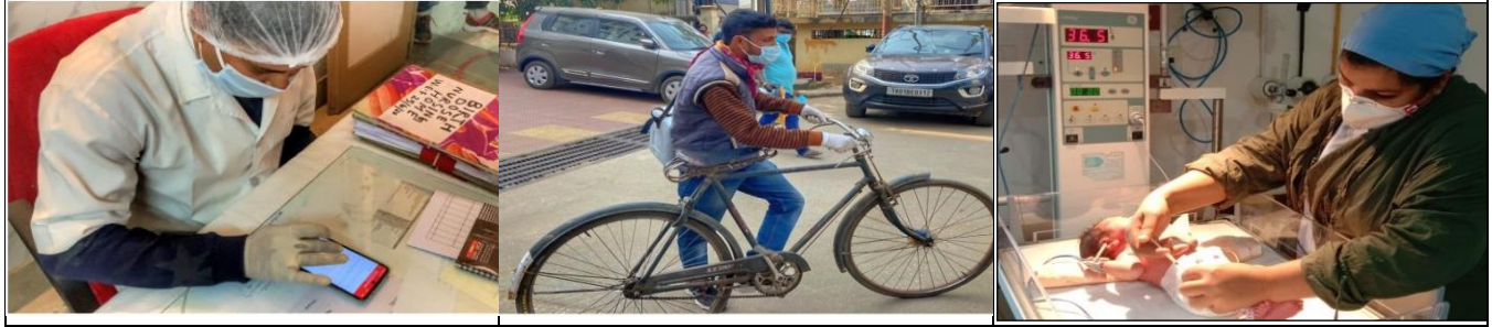
mage 4:Issuing Vaccine in eVIN portal at IGM mage 5: Alternate vaccine delivery system